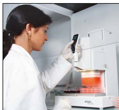
Figure 4: Pipetting in a laminar flow hood.