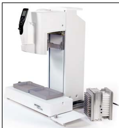
Figure 2: Convenient exchange of a pipetting head.

The drive for higher sample throughput and the urge to cut cost per reaction looks set to continue. Today your lab might still be working in 96-well formats, but tomorrow you maybe want to switch to 384-well plates. If you see a need to work with 384-well plates down the road, it might be better to buy a pipette which can work with both 96- and 384-channel pipetting heads. If you worry about the higher cost for such a device, at least make sure your 96-channel pipette has a convenient indexing functionality for 384-well plates and provides a way to work precisely with volumes between 0.5 to 50 \mu l.