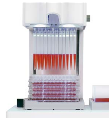
Figure 3: Repeat Dispensing allows quick filling of multiple plates.